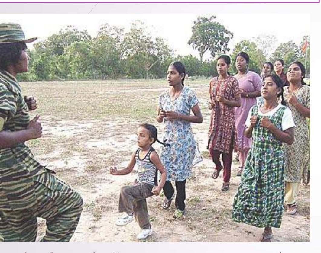
w.lankaweb.Com Newspapers Ltd. May 2006