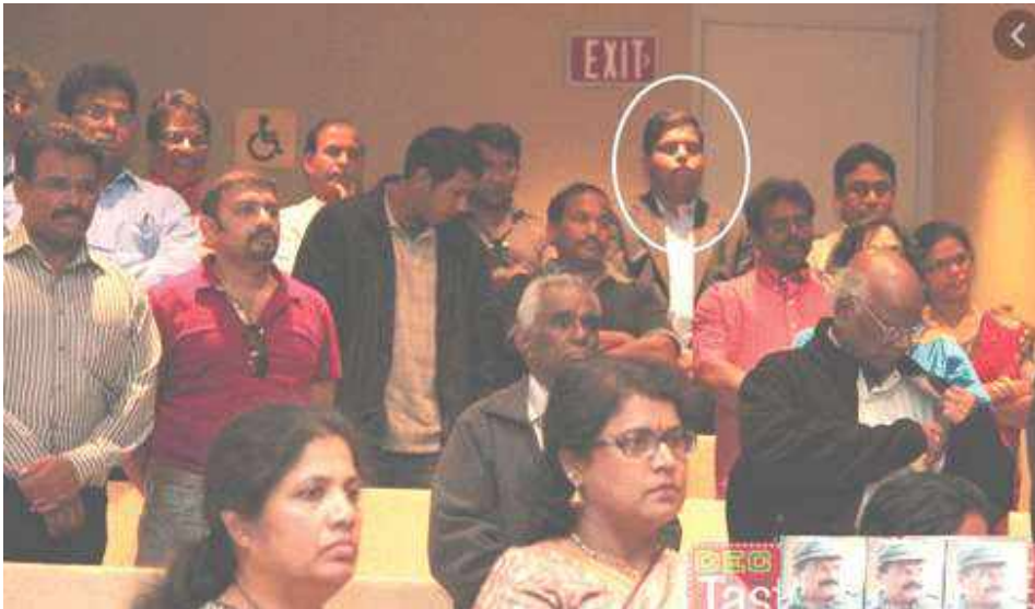
Political Aspects of Alleged Tamil Genocid