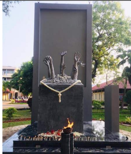
Figure 2: Rebuilt Mullivaikkal monument in Jaffna University at the same location

The City of Brampton has passed a similar resolution with the request of the Tamil group. However, Brampton residents with Sri Lankan heritage challenged the City's action with Charter violation, and a Notice of Application has been filed, Court File No: CV-21-00001483-0000. I attached the Notice of Application for your consideration.