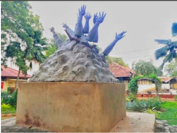
Figure 1: Original unsafe Mullivaikkal monument built at the Jaffna University, Sri Lanka.

Therefore, the justification for building the Tamil monument quoting the demolition of Mullivaikkal memorial does not substantiate.